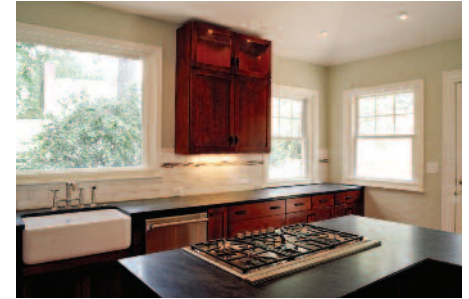
This state of the art kitchen remodel includes custom cabinetry, Soapstone countertops and upgraded appliances.