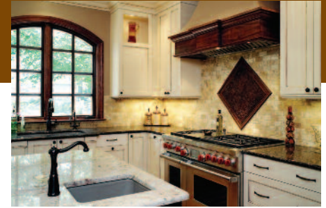
This beautiful kitchen remodel features an enlarged French window, antique corbels support hood and large antique ornament on backsplash tile.