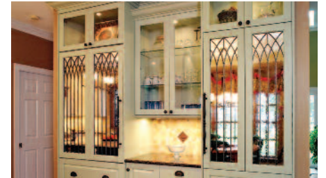
Antique mirrored glass on the refrigerator and pantry doors adds additional charm and character to this newly renovated kitchen.