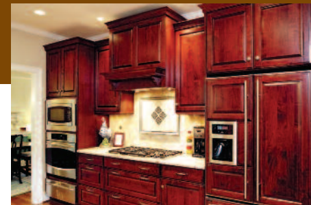
Beautiful Brookhaven maple cabinets with candlelight finish along with granite countertops and decorative tile work are highlights of this kitchen.